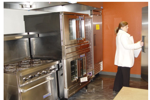
ASC Visits Bethel in Richland