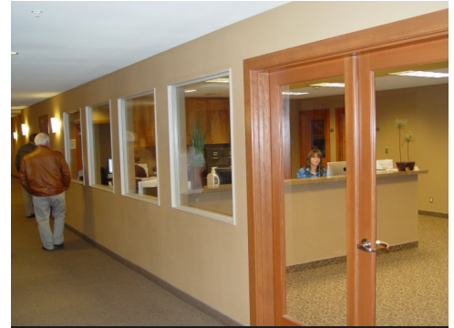
ASC Visits Trinity in Walla Walla