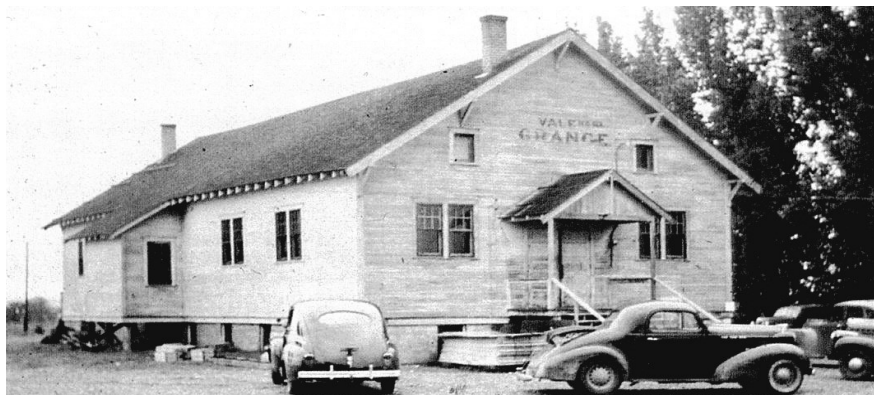
Richland Lutheran Church - Vale Grange Hall

As we approach our 70 th Anniversary, we affectionately look back on