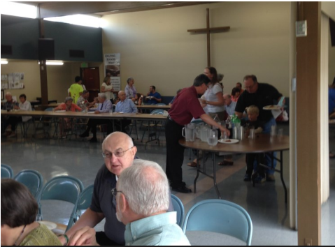
August 18, 2014 Workshop