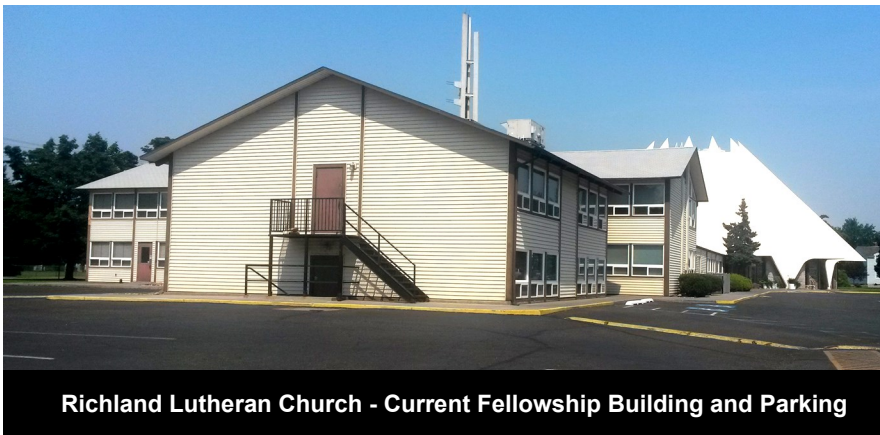
Richland Lutheran Church - Current Fellowship Building and Parking

In 1953, we began working with an architect to draw up plans for a new Fellowship Building. In 1956, we broke ground on the Prince of Peace, kitchen, office wing, and lower education wing. In 1965, volunteers added a second story to the education wing. In 1966, we broke ground on the Sanctuary. The money for all these remodels and new builds came largely from parents raising children; but they made ministries and facility upgrades top priorities.