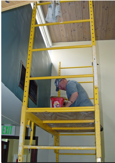
Gary Weible Paints Walls