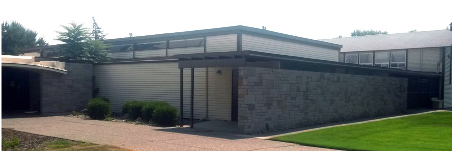
Richland Lutheran Church - Fellowship Building Constructed in 1956